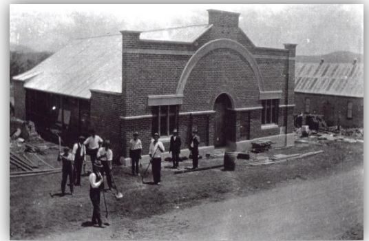
Memorial Hall completed 1925 with 1895 Hall (right)