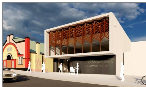
Narooma Arts & Community Centre (NACC) DA approved by Eurobodalla Shire Council