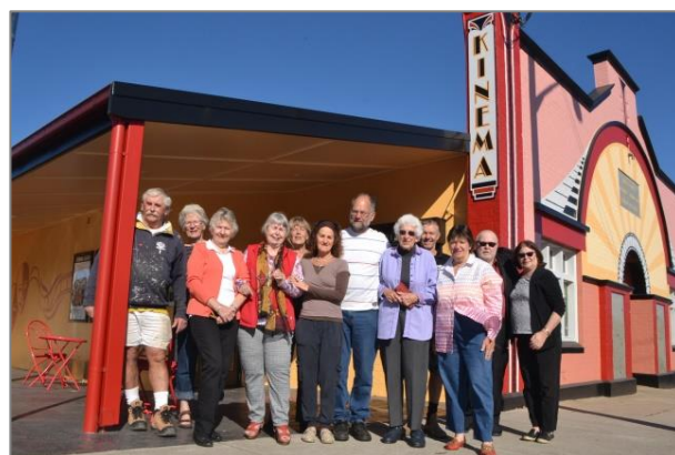
Hall Project completed early 2018 showing some of 'the team'