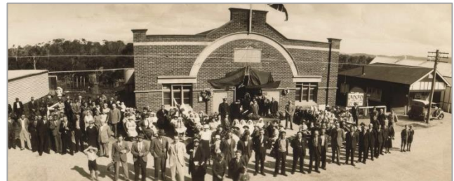
Anzac Day 1935