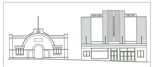
Architect C H Strachan-Smith's 1952 plans for dedicated brick picture theatre next to Memorial Hall – similar footprint to NACC