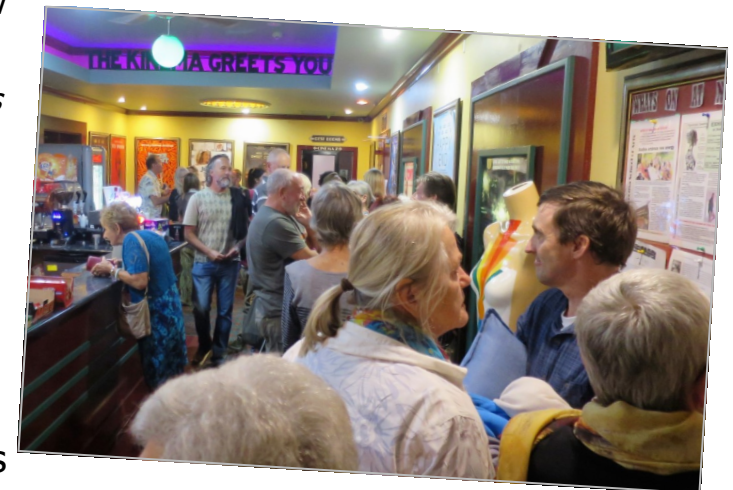
Foyer congestion was an issue